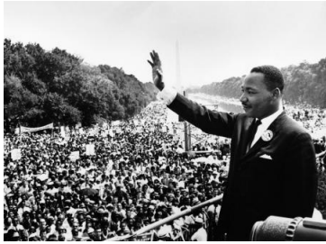
Martin Luther King, Jr., addresses a crowd from the steps of the Lincoln Memorial, 1968.