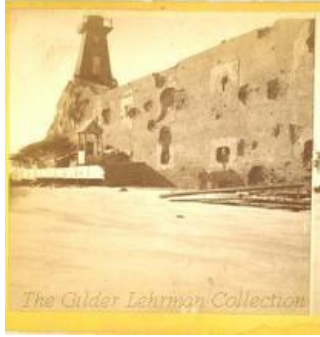
"Fort Sumter from the East"