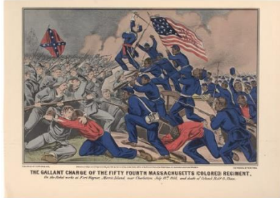
The Gallant Charge of the Fifty Fourth Massachusetts (Colored) Regiment, on the Rebel works at Fort Wagner, Morris Island, near Charleston, July 18th, 1863, and death of Colonel Robt G. Shaw, published by Currier & Ives, New York, 1863.