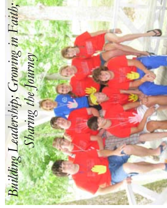
Building Leadership; Growing in Faith, Sharing the Journey

Typically Weeks 2 & 3 of summer camp. You will go home on Friday evening and return Sunday afternoon. You will also then stay for the following weekend camp session.