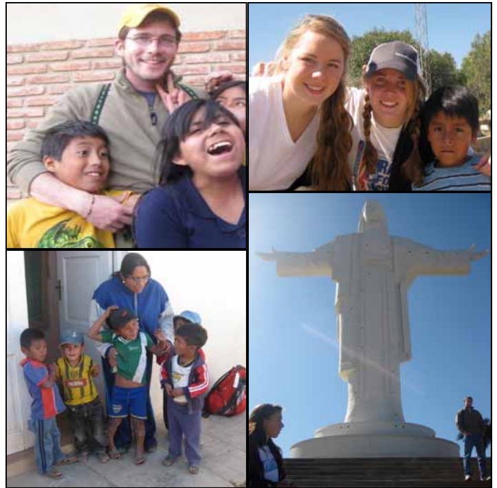
Youth in Bolivia 2009