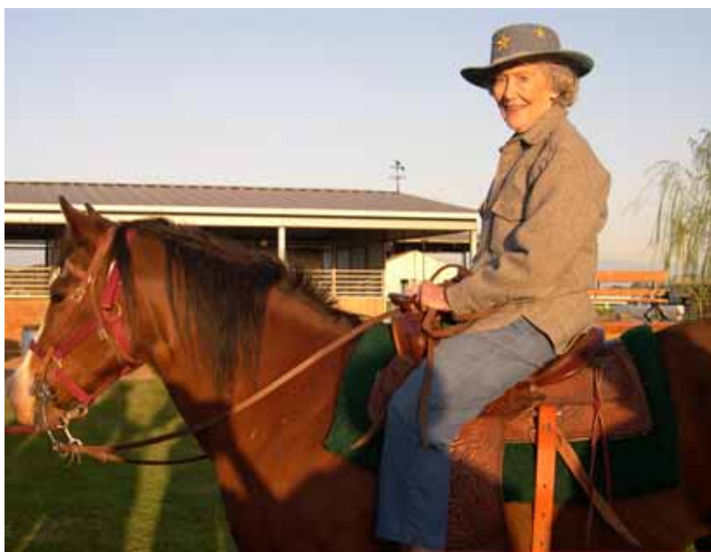
This photo originally appeared in the Journal on Active Aging and is reprinted here with permission from the International Council on Active Aging.

Horseback riding, musical theater performances, a deep sense of spirituality — these are just some of the distinctive features of the healthy living culture at San Joaquin Gardens in Fresno, Calif.