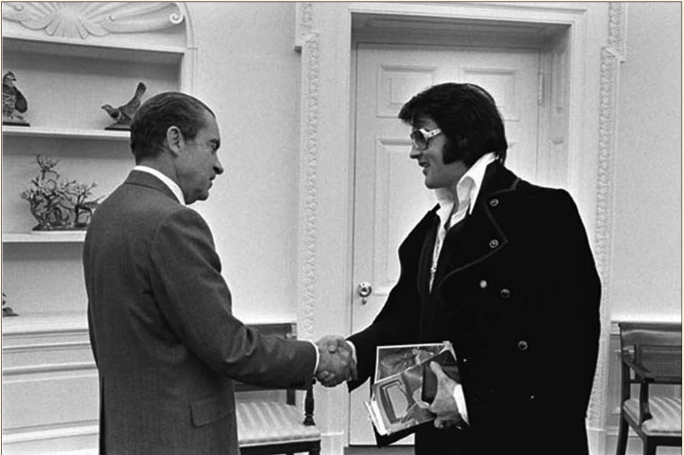
President Richard Nixon greets Elvis Presley at the White House. One of the reasons Elvis visited the president was to ask him for a badge from the Bureau of Narcotics and Dangerous Drugs. The president obliged, and Elvis added it to his extensive badge collection.

That wasn’t the only thing that Winfield Dunn regrets about that casual visit with Elvis. “I can tell you that when I got home, my wife was not happy with me because I didn’t take her with me. Was she ever!” ☹️