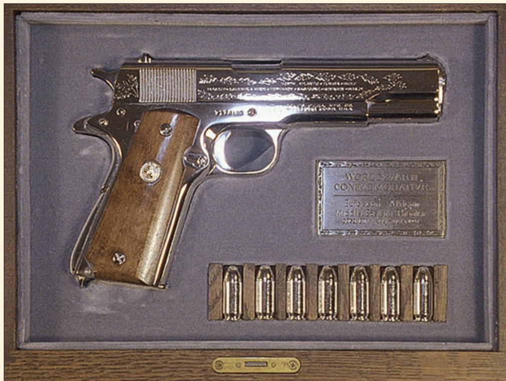
In a letter to Richard Nixon, Elvis Presley said he had a “personal gift” he’d like to present to the president. The would-be gift was a World War II-era Colt.45 pistol, but Elvis wasn’t allowed to give it to Nixon in person because no guns were allowed in the Oval Office.

The White House security guard gave the letter to Dwight Chapin, a member of the White House staff, who subsequently called Egil “Bud” Krogh, the White House deputy for domestic affairs.