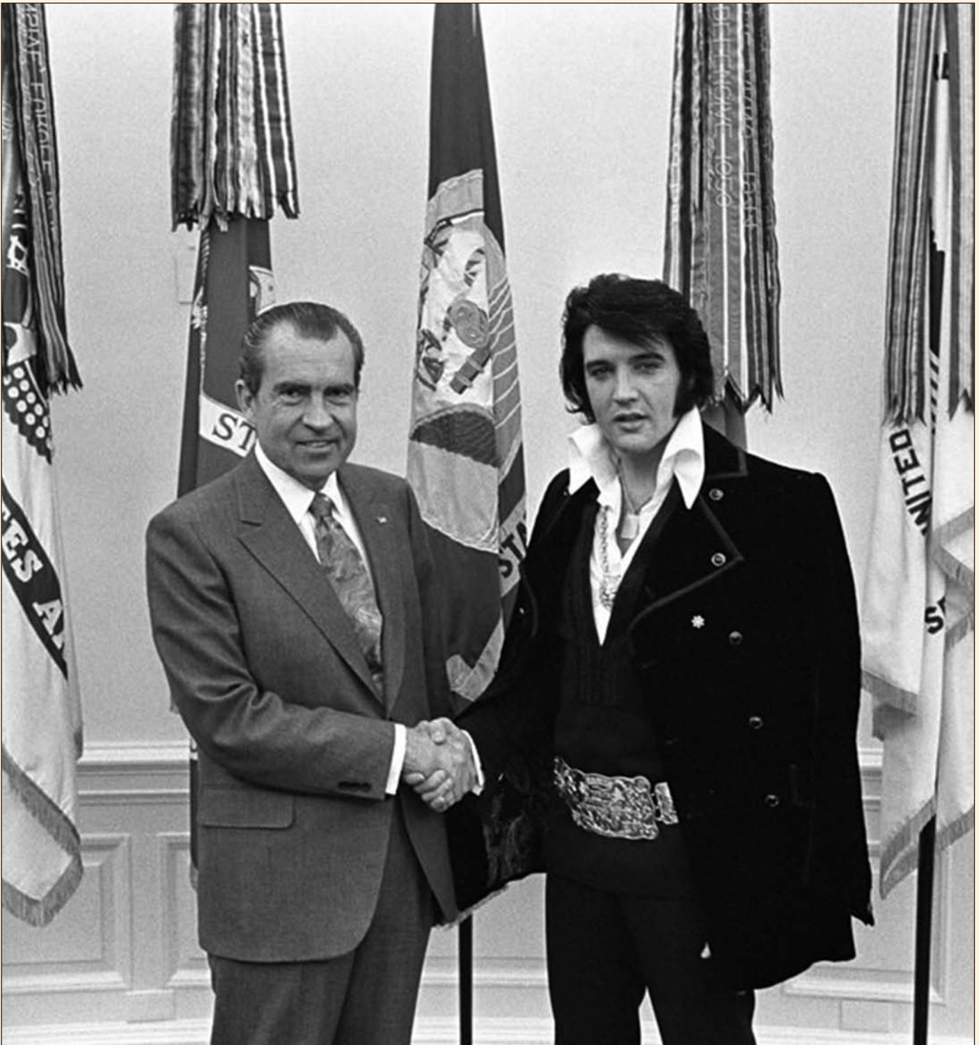
Above is the most-requested image in the Library of Congress — Elvis Presley meeting President Richard Nixon on Dec. 21, 1970. During his flight to Washington, D.C., Elvis wrote a letter, opposite page, to the president using stationery he got from a flight attendant.