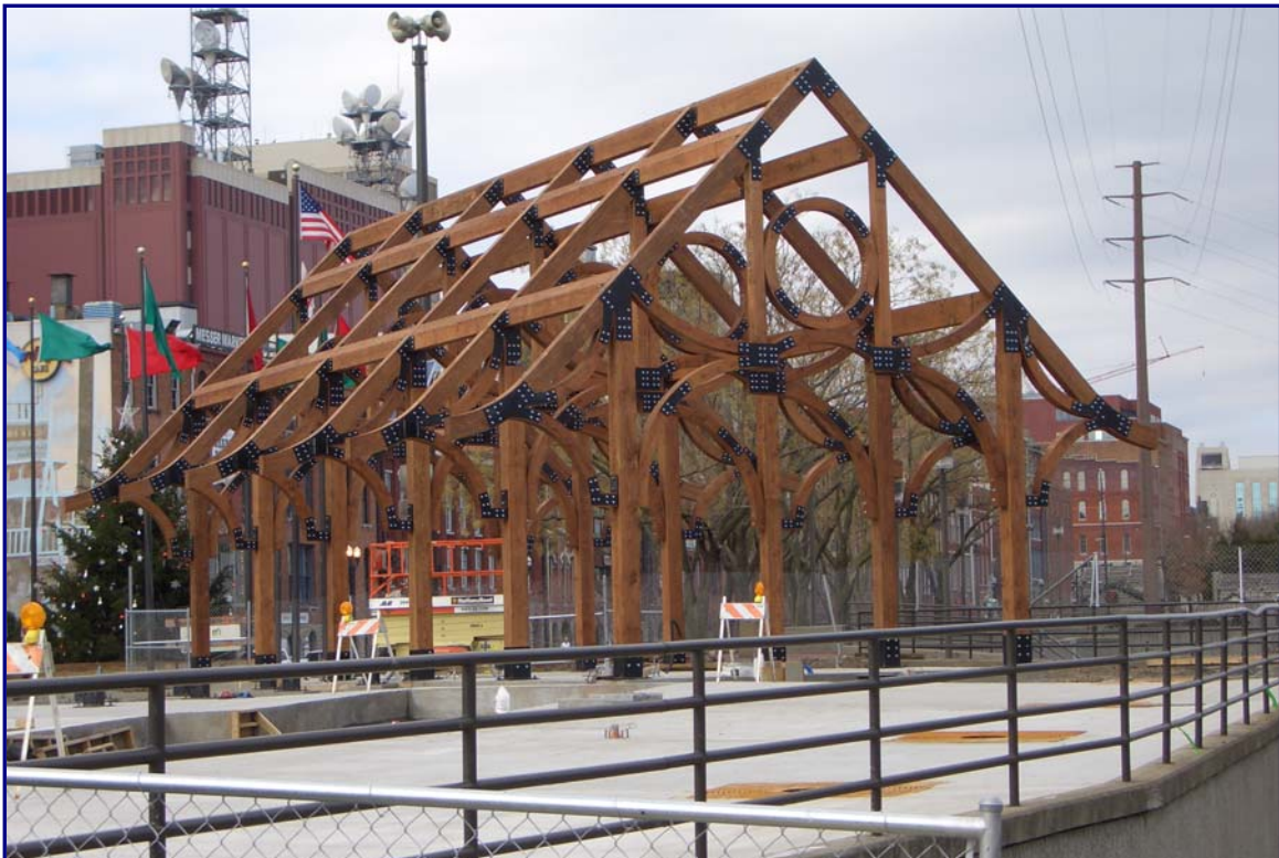
December 27, 2005 – Riverfront Station Building Framing