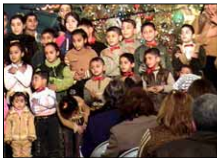
St. George's, Baghdad

The Anglican church of St. George's, Baghdad is the latest and perhaps most challenging of our parish's missions in the world at large. It serves an indigenous Christian community in the unprotected 'red zone' of the city and is constantly in physical danger, both to its people and to its buildings in the sectarian violence that continues to keep the place in perpetual turmoil.