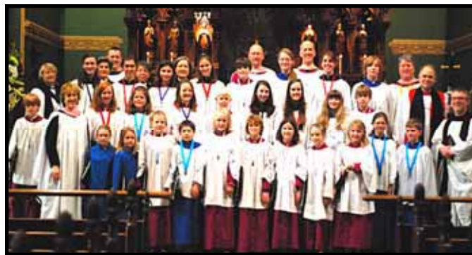
Diocesan Chorister Festival 2009