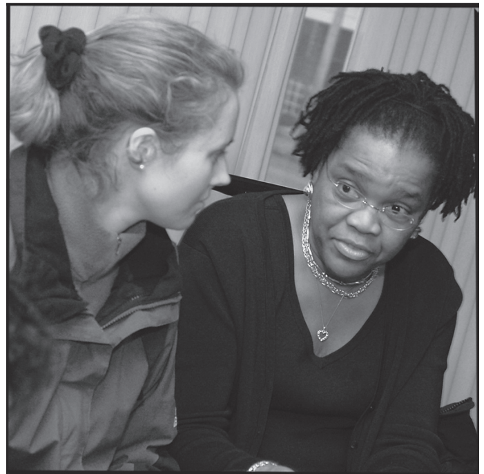
Participants discuss the future of social justice at February’s “Where Do We Go From Here?” event.

Over 500 words diluted to less than 125 after the subtraction of common words, phrases and sentiments; not exactly a quantitative result, but certainly one that promotes hope that we might someday soon be able to dialogue through our differences for a common good.