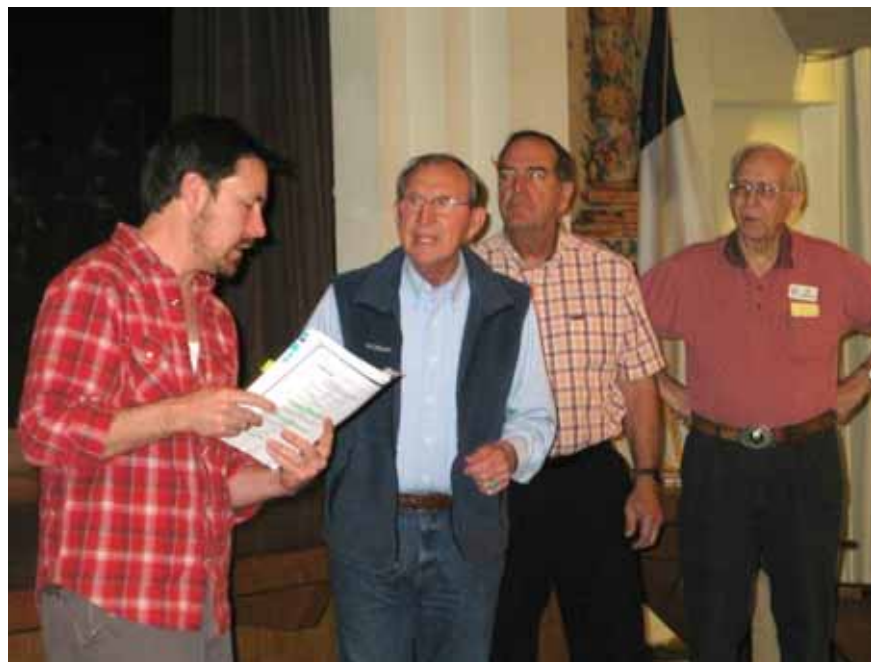
Actors rehearse for San Joaquin Gardens' production of "Guys and Dolls."