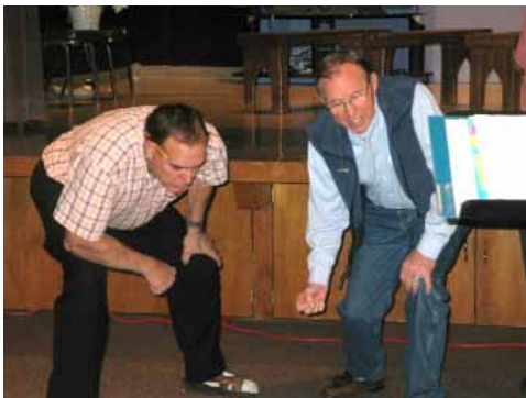
“Guys and Dolls,” shown here in rehearsal, was performed March 18 and 19 at San Joaquin Gardens.