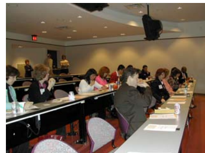
Thanks to the General Board of Discipleship Learning Center for the use of its beautiful facility for our February meeting.