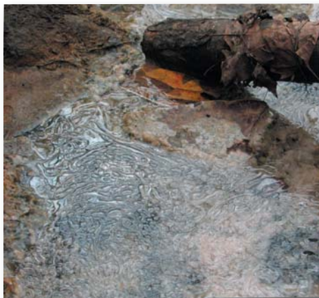
Chemicals seep into Liberty Creek and the Harpeth.

The spill contains several contaminants including toluene, acetone and benzene, a known carcinogen. The pollution continues and the company continues doing business daily with no fines or other penalties a year and a half after the state issued an order for ELMCO to create a clean up plan.