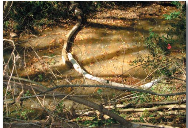
Liberty Creek is dead- covered with putrid decomposing bacteria and algae.

An active clean up would remove chemical contamination as required by EPA guidelines.