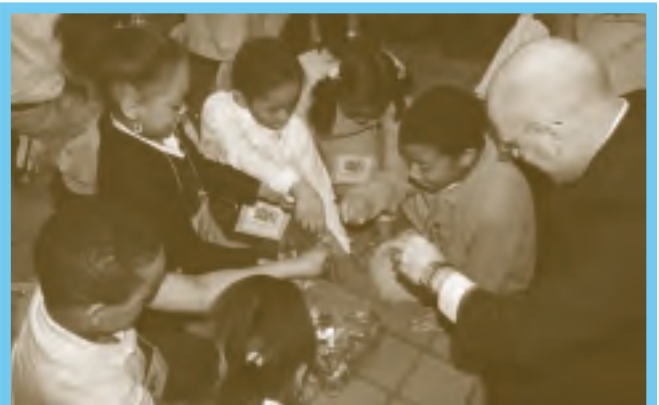
Students at Jones Paideia prepare to tally their collection of pennies!

Benjamin Franklin once said, that a penny saved is a penny earned. Well that is certainly true for students at Pennington, Jones Paideia and Thomas Edison Elementary Schools. Students at these schools, as well as the University School of Nashville, are participating