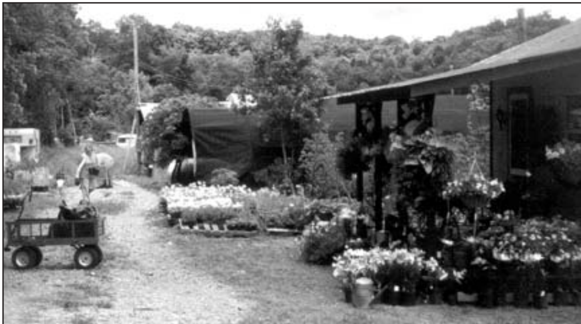
Campbell Century Farm in Maury County, courtesy of the family.