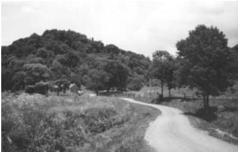
Cannon County Duggin Farm

This Tennessee Century Farms newsletter is produced as a public service by the Center for Historic Preservation at MTSU.