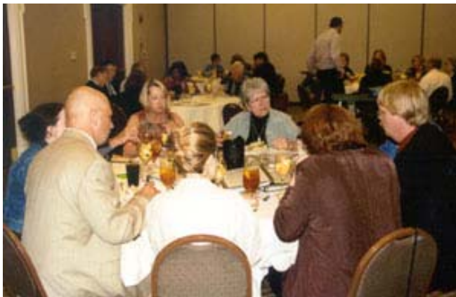
HDI participants discuss issues during lunch.

Thirty heritage development professionals from Alabama, Arkansas, California, Georgia, Illinois, Indiana, Kentucky, Pennsylvania, Tennessee, and Washington, DC, participated in the workshop.