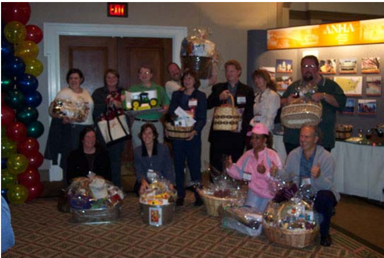
Recipients of ANHA Gift baskets. Louisville, KY, September 30, 2004.