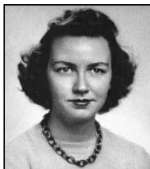
Mary Flannery O'Connor 1925-1964

Literary scholars contend that no other modern American writer of the twentieth century has constructed a fictional world so energetically and forthrightly charged by religious investigation as the one Flannery O'Connor has created. As a "literary theologian," O'Connor demonstrated that religion, far from being an impediment to art, may serve as the vital center of the artist's imagination.