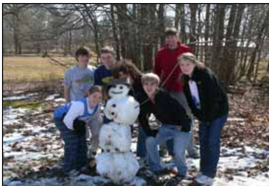
Time-off for fun in the snow at the Youth Confirmation Retreat.

Thank you to our faithful supporters and . . . Save the date for Tuesday, March 8, 2011!