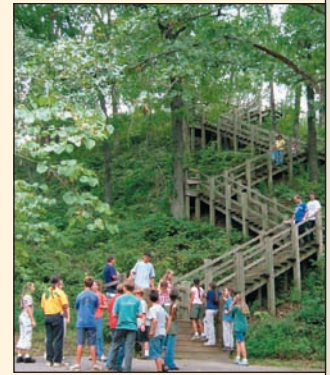
Pinson Mounds State Archaeological Park

Note: Students in grades not included in the above summary study world history instead of Tennessee-specific subjects. Want to get a preview of some of the places recommended here? Go to the Tennessee History for Kids Web site, www.tnhistoryforkids.org , click on “Virtual Tours” and scroll down. You’ll see them listed on the left side. ☺