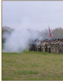
Shiloh National Military Park

like in the fourth grade, eighth-graders take an early American history class with Tennessee lessons “imbedded” throughout the year — theoretically in more detail. And all the places that worked for fourth-graders should also work for eighth-graders. Just remember that eighth-graders should be able to grasp more than fourth-graders but also have more distractions. Keeping it interesting for an eighth-grader is more important, but keeping his or her attention is more of a challenge.