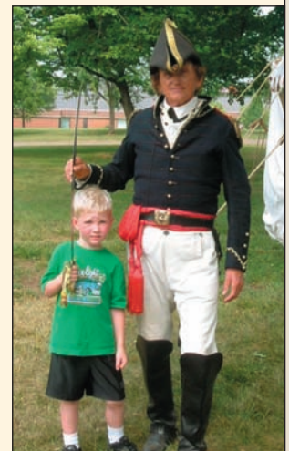
Meeting “Andrew Jackson” at the Hermitage.