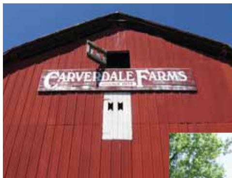
(Top and Right) Carverdale Farm 2006