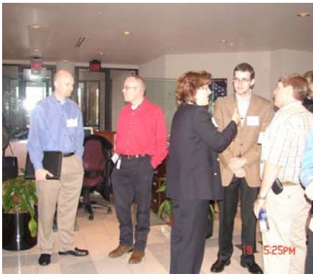
Members and guests networking prior to program.