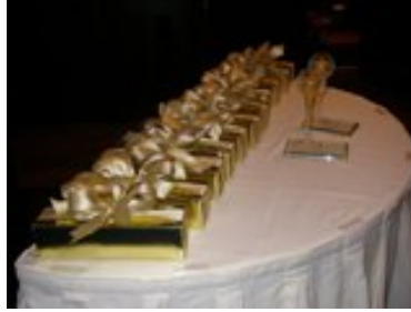
December 13 th Breakfast