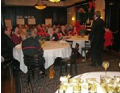
December 13 th Breakfast