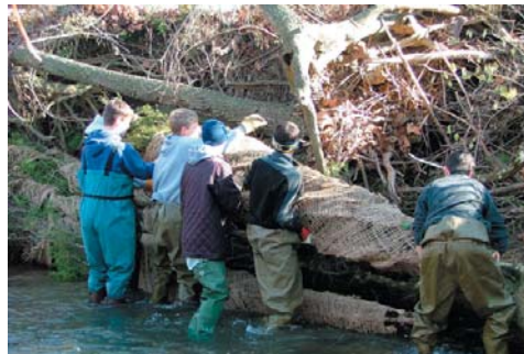
Working with local scout troops, HRWA stabilizes streambanks to stop erosion.

Contact us to learn how your group or company can participate!