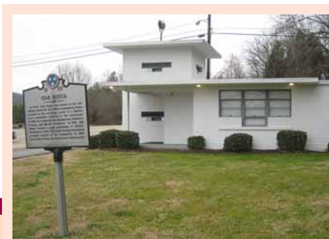
Guard House at Oak Ridge, Anderson County