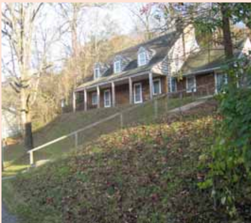
Pi Beta Phi dormitory in Gatlinburg, Sevier County