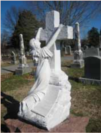
Headstone at Oakland Cemetery in Trenton, Gibson County

Smithson-McCall Farm, Williamson County Oakland Cemetery, Gibson County Pi Beta Phi Settlement School Multiple Property Submission, Sevier County Promise Land School, Dickson County Pi Beta Phi Dormitories and Dwellings District, Sevier County