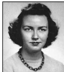
Mary Flannery O'Connor 1925-1964

A film and discussion on poverty in Nashville.