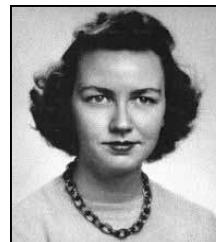
Mary Flannery O'Connor 1925-1964

A film and discussion on poverty in Nashville.