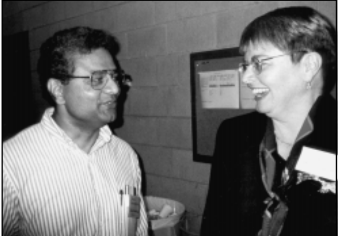
NORTH CAROLINA CONVOCATION