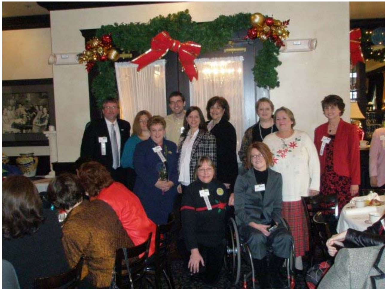
The 2008 Middle Tennessee ASTD Chapter Board Members at the Holiday Breakfast Meeting & Golden Torch Award Ceremony