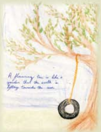
5th Grade Student