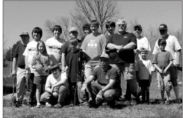
The volunteer crew at Piney River on April 1st.

March 18th, 2006, we got our feet wet again, working with Scout masters, Scouts and other volunteers at the Head of River Spring, a site on the Harpeth River in Eagleville in Rutherford County. In total, twelve revetments and two coir logs (the latter are "logs" of interwoven fibers wrapped around by biodegradable netting) were installed, and native cane was planted for long term stabilization of the streambank. The area treated was approximately sixty linear feet.