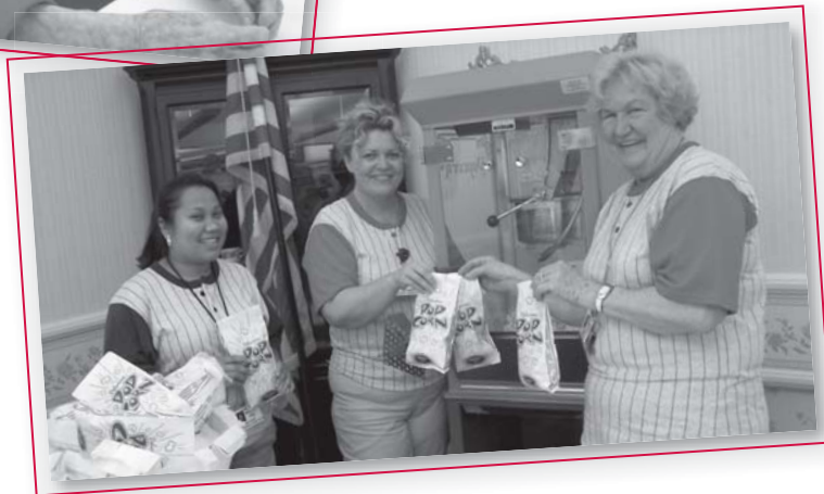
Rosewood staff members get things poppin' in traditional ballpark fashion.